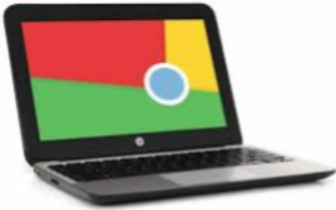
1-1 Chromebook Information

Our 1:1 equipment program is about learning and not technology! This program will inspire our students with hands-on learning and can be used to promote creativity in the classroom. This innovative tool has the capability to provide personalised learning and education in a number of different subject areas. The device allows students to gain access to a continually growing bank of educational content. Please watch for further information and a link to the Bruce-Grey Catholic District School Board Assumption of Responsibility for Borrowed Equipment Form.