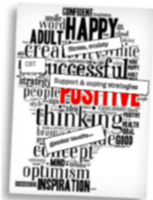
Thursday Mental Health Brief Clinic

Student will be seen in guidance, by appointment only. Wait to be called.