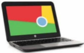
1-1 Chromebook Information

Final day will be Friday, October 9th. We still require parent(s)/guardian(s)/18 yr old Student to assume responsibility for the device, especially lost. To get more information, click the icon below left and to accept responsibility for the device use the icon on the right.