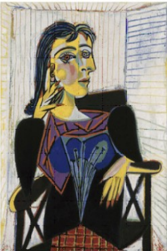
Pablo Picasso (Spanish, 1881-1973) Portrait of Dora Maar (Portrait of Dora Maar), 1937 Oil on canvas 92 x 65 cm Musée National Picasso, Paris

MASTERPIECES FROM THE MUSÉE NATIONAL PICASSO, PARIS EXPERIENCE Picasso's own collection. 147 works he kept for himself